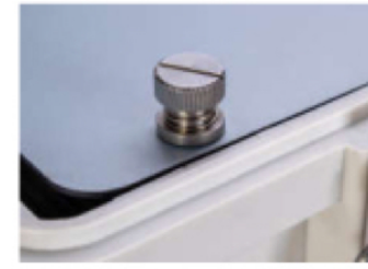
Inner door Screw