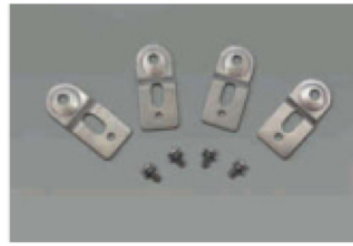
Stainless steel brackets (not include in standard supply)